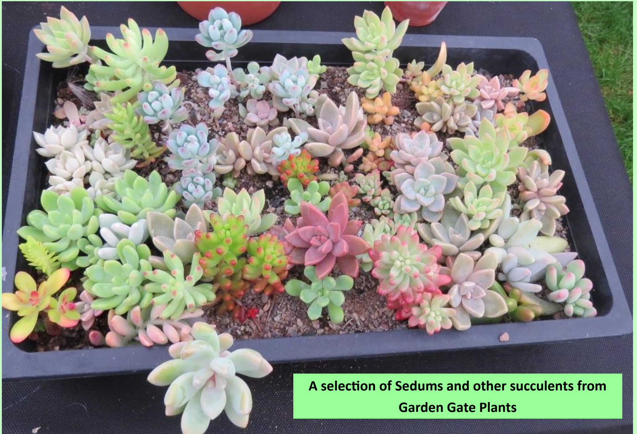
A selection of Sedums and other succulents from Garden Gate Plants