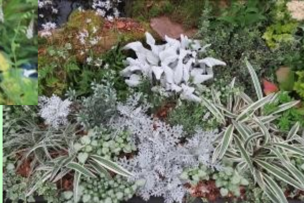
Dundee Council staged a wonderful white and silver garden. Much thought must have been given in the planning stage to be able to use so many good white flowered plants. Look and Learn!