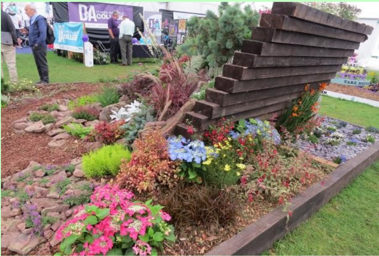
Dundee & Angus College had a superb exhibit. It was based on the design of the new about to be opened Victoria & Albert Museum at Dundee Waterfront. I admired the design and planting at this year's Gardening Scotland and I admired it again here. Naturally the plants were different