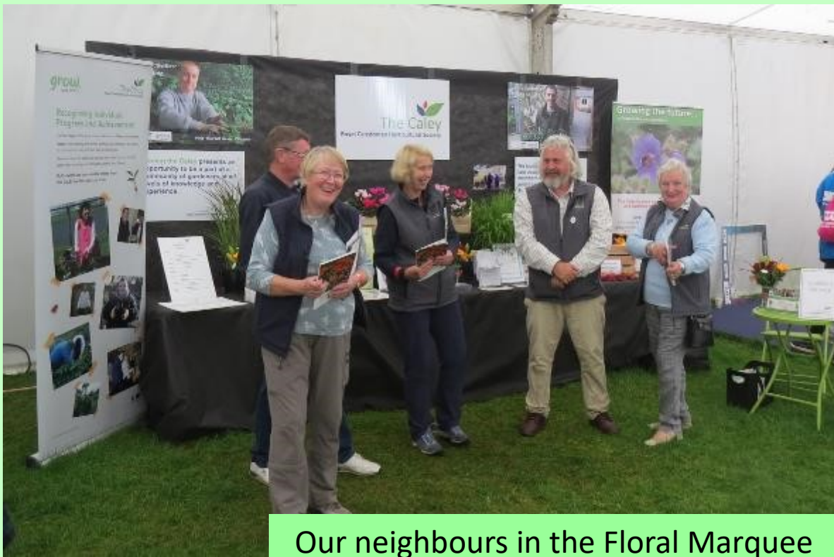
Our neighbours in the Floral Marquee