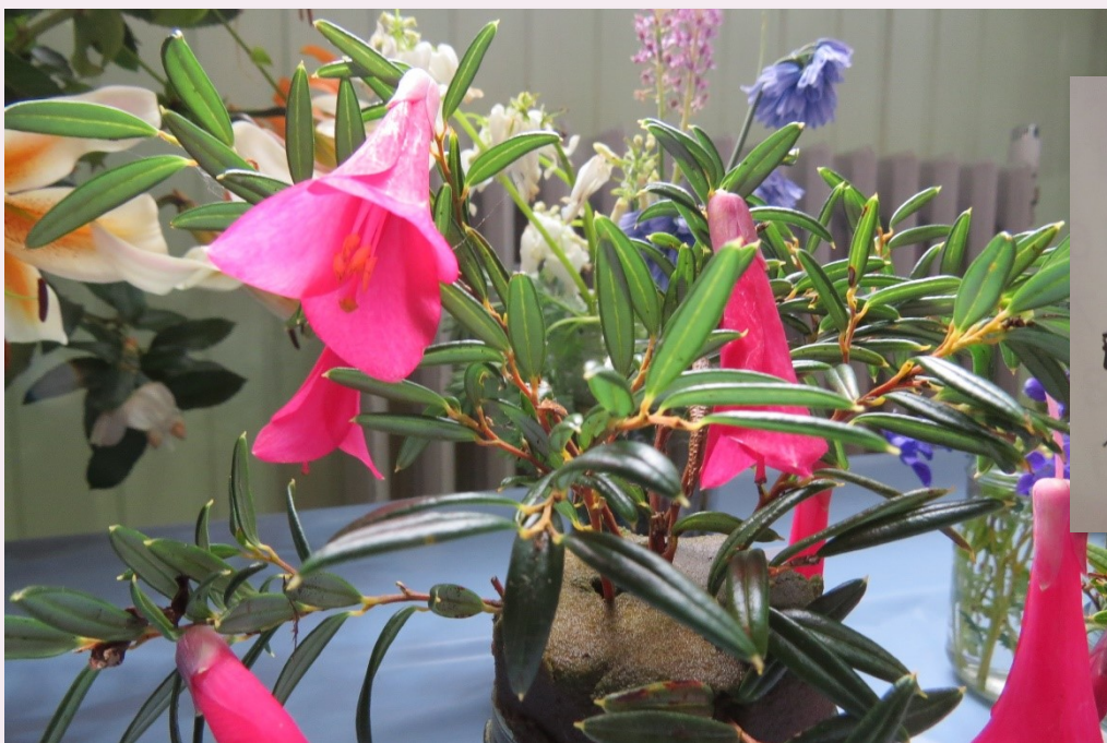
PHILESIA MAGELLANIC Evergreen, trailing shrub 12-15" tall semi-shade.