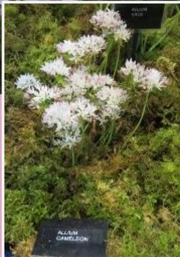
Allium 'Cameleon'. Yes it is spelled that way because it was named in the Netherlands. It is about 10cm high with typical Allium flowers which open pink and fade to white.