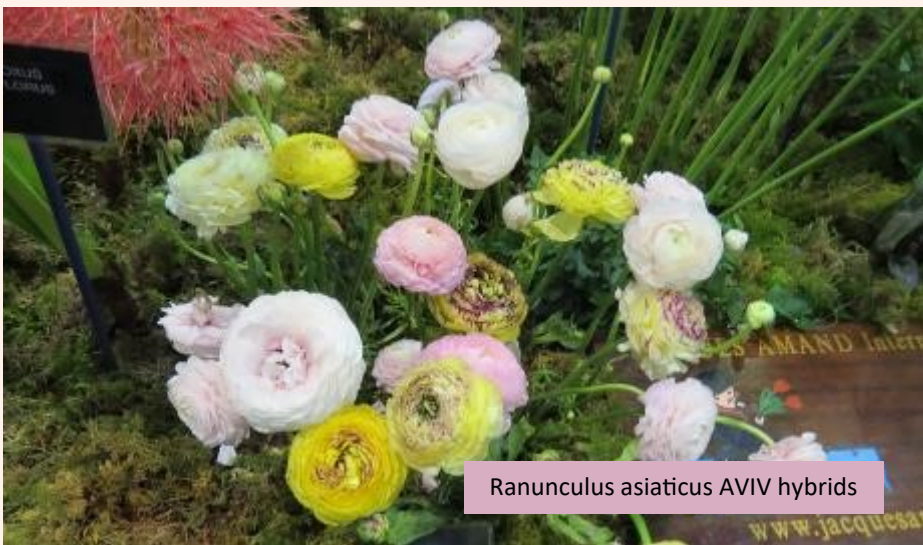
Ranunculus asiaticus AVIV hybrids