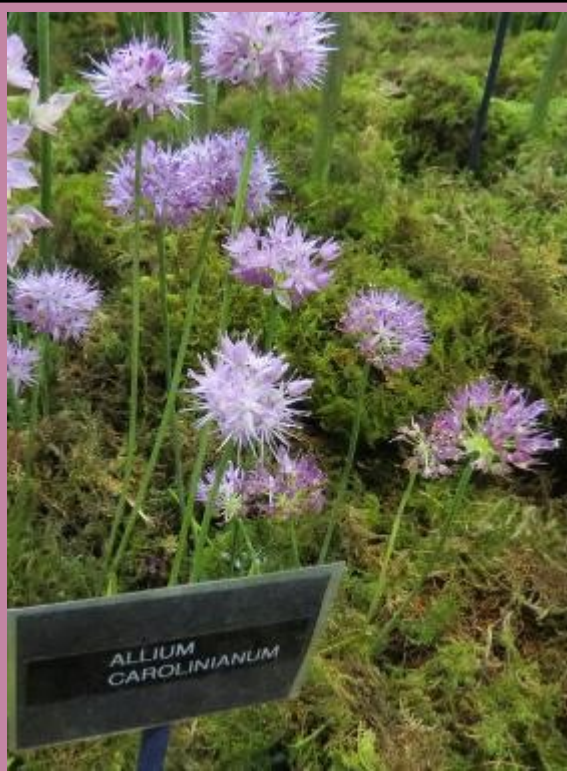
Allium carolinianum is slightly taller than A. 'cameleon' but its flower heads are rounder and smaller. It is a deeper purple colour