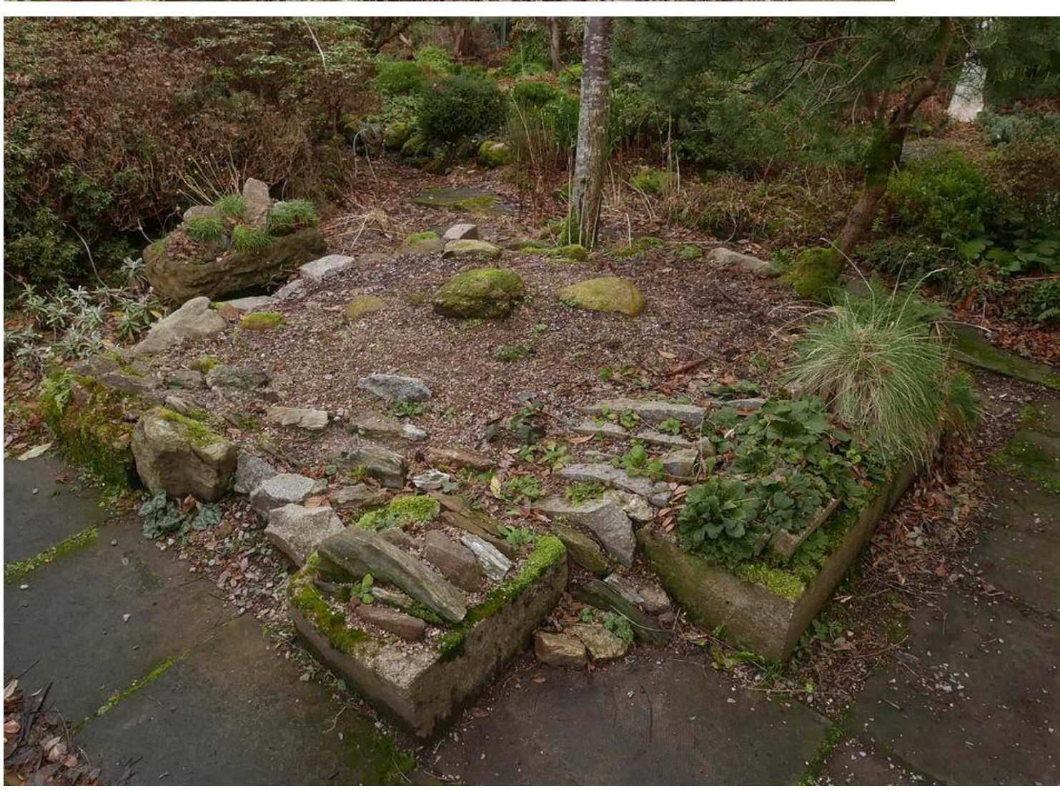
I constructed this new bed beside the pond in the summer and have been planting it up through the autumn in my inevitable informal and un-labelled way so I am excited to see what comes up in the spring. Once I see how it looks I will work to enhance it further with compatible plants.

Looking forward to next year some of the projects I have been working on will continue such as this area I am reclaiming from the shrubs. Cutting them back or removing the lower branches will open up the ground level for further planting opportunities. I have already started the area in the bottom left and in time hope to open all the area behind the seat.