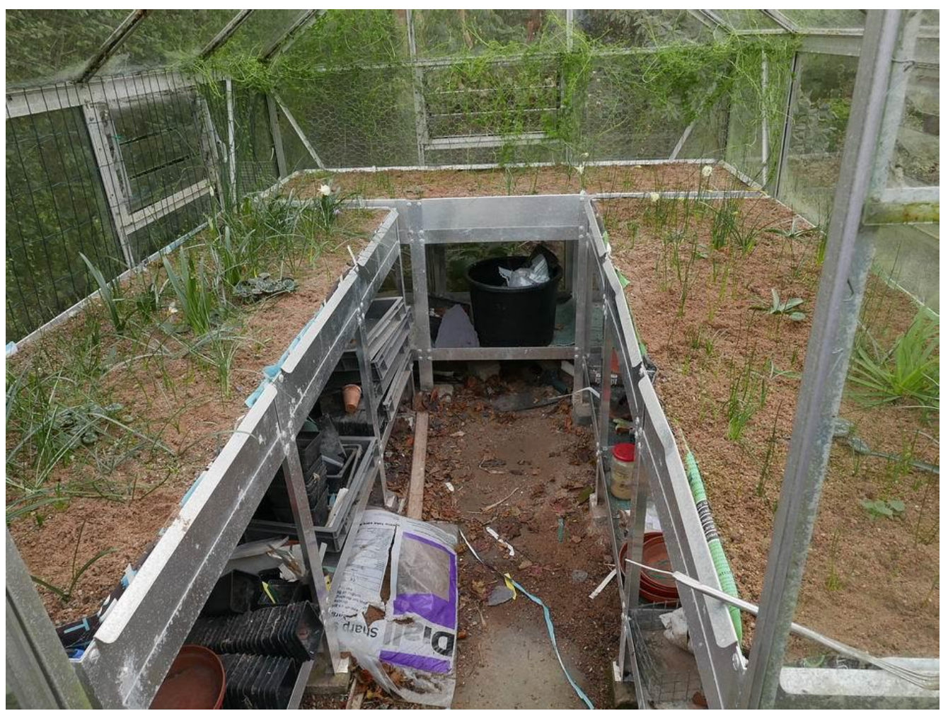
The ongoing expansion of the sand beds where all the bulbs are planted directly into sharp sand has seen what was the Fritillaria house completely converted—the one on the left was converted this summer the other two were done last year. Now instead of the rows of pots which I have had for over thirty years I have the new excitement of indoor bulb beds to plant in my informal way.