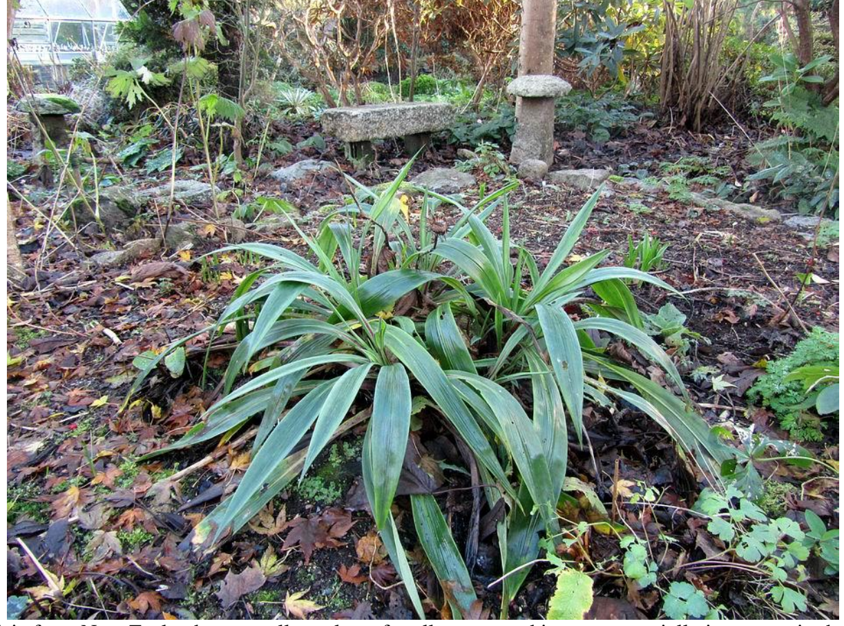
The Celmisia from New Zealand are excellent plants for all year round interest especially important in the winter for bringing structure to beds where most other plants are underground. I have never been able to find the name of this one.

The Ophiopogon had flowers in late summer/early autumn and is now bearing fruits which something has been eating.