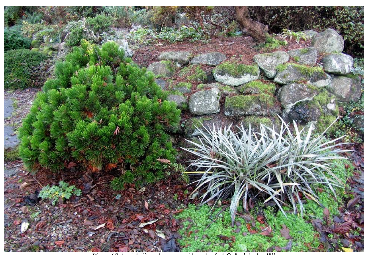
Pinus 'Schmidtii' and narrow silver leafed Celmisia lyallii It is only when viewing this picture that I realize this pine is as now as tall as the wall of the raised bed.