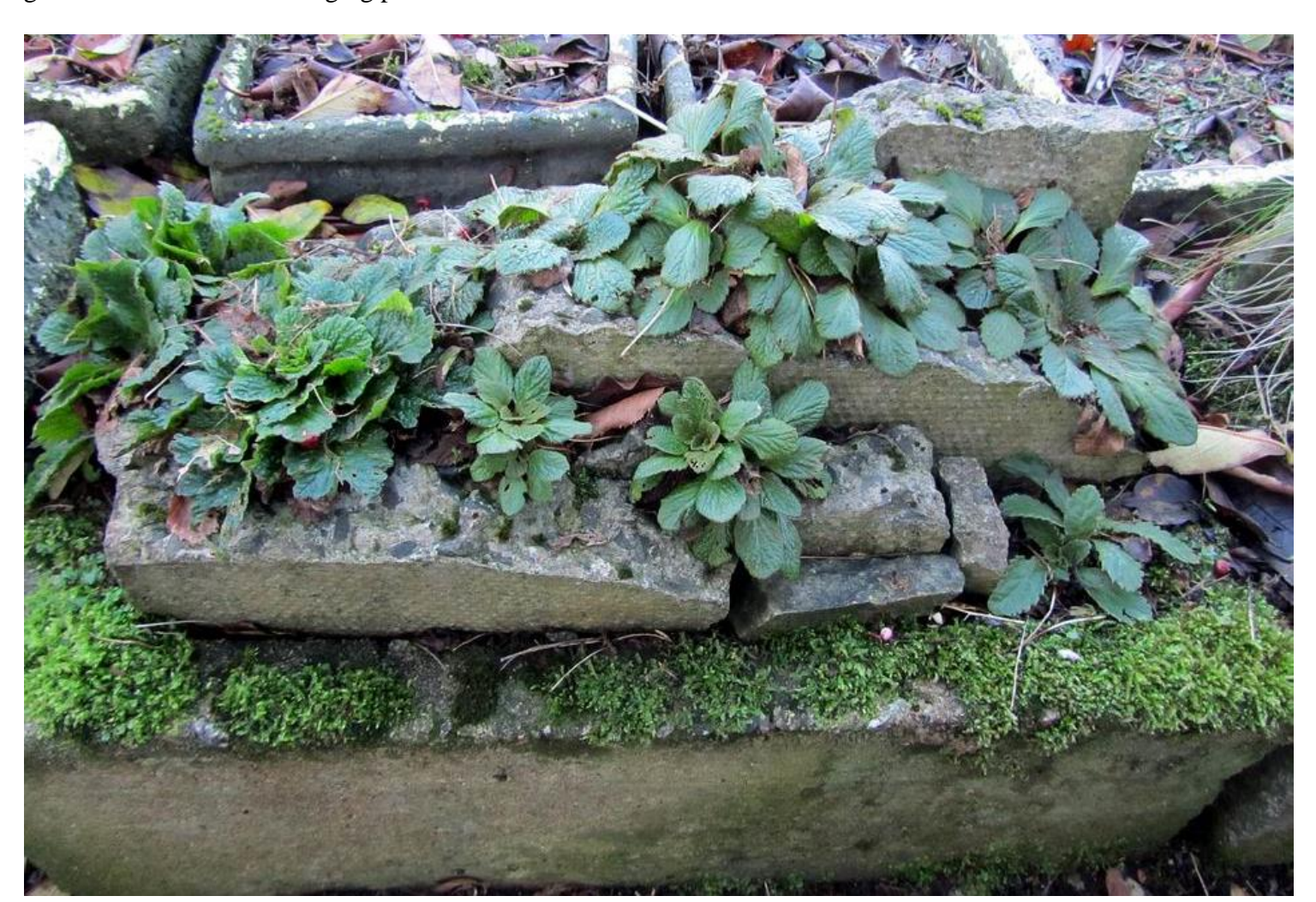
This is an earlier venture into my use of concrete for landscaping troughs – this time it was broken concrete paving slabs that I used. I wanted to create some crevices to grow Ramonda myconi , on the left, and Ramonda nathaliae - the plants have grown well but the slabs still just look like broken slabs. Unlike the open porous concrete blocks these slabs are impervious to water penetration and so do not attract moss except from along the top broken edges and as they are also much harder they cannot be carved and disguised so easily.

experimenting with different methods of creating 'extreme environments' may just lead me on to being able to grow some of those challenging plants.