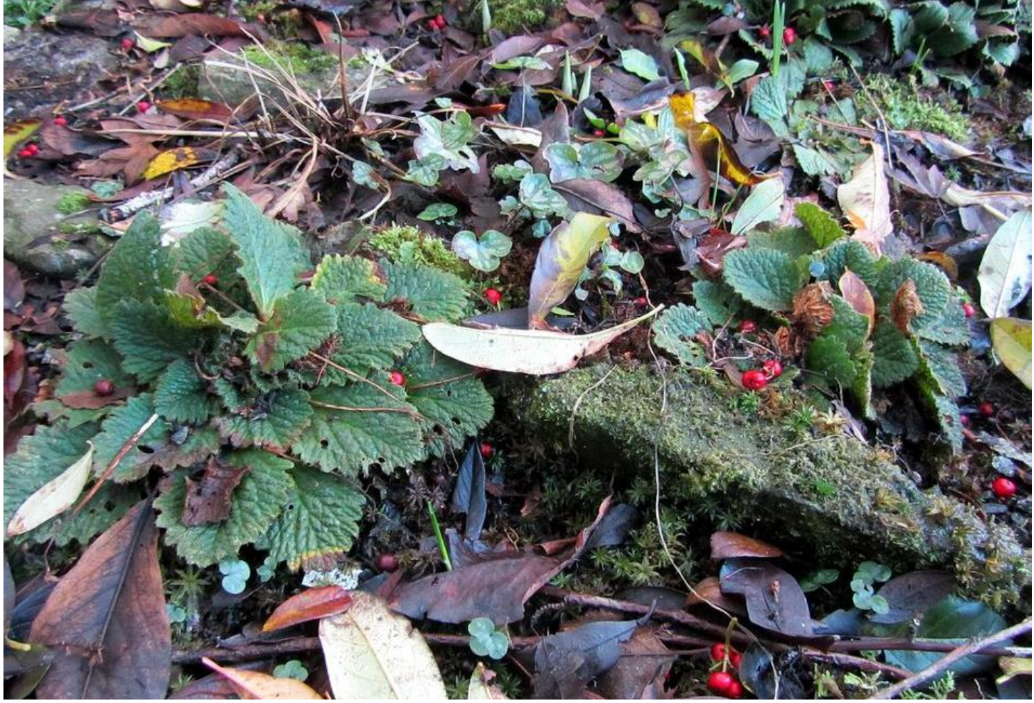
Many forms of Ramonda myconi also grow in this bed along with the bulbs and Hepatica seeding around.

Haberlea rhodopensis is another member of the Gesneriaceae whose evergreen nature provides welcome winter interest - here it is growing in what was a rock garden bed before it became over shaded by the growing trees and shrubs. Now this bed is home to shade loving subjects and spring bulbs.