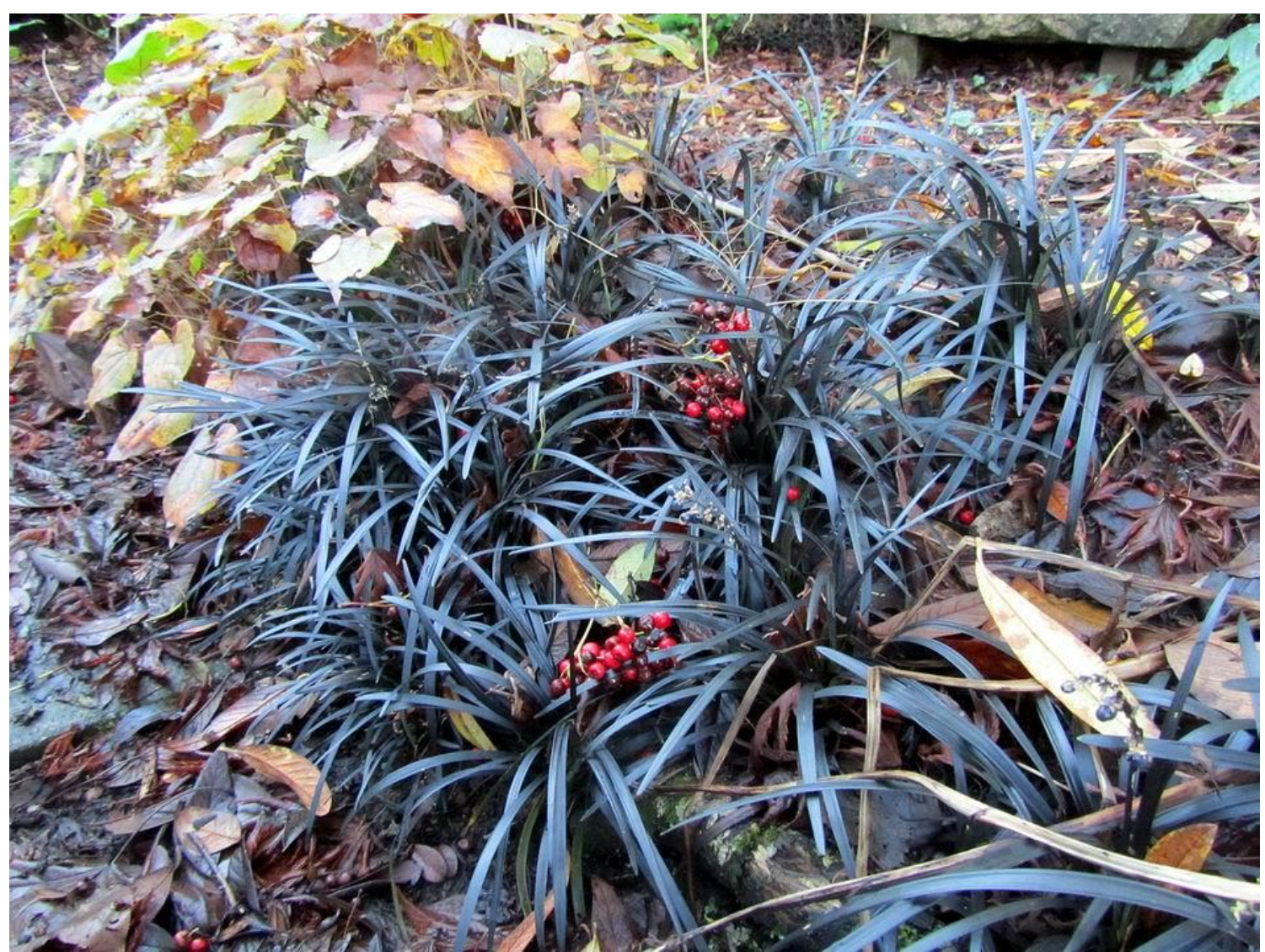
The dark narrow leaves of Ophiopogon planiscapus 'Nigrescens' can get a bit lost when the garden is in full growth when your eye being drawn to the brighter colours but in winter they do stand out.

Did you notice the Iris 'Katharine Hodgkin' shoots towards the top of the picture above they are already well extended ready to spring into flower. I have never known them to flower before the turn of the year - mostly they start to open in early February if the conditions are not too cold. More fallen leaves to clear up when we get a dry spell.