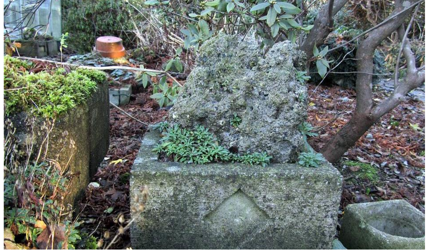
Around two months ago I chiseled a lump of concrete block into a more natural looking shape and also drilled a series of holes into it mimicking those in the limestone marl - I then transferred some Erinus seedlings; some planted around the base and the smaller ones into the drilled holes. My long term aim is to allow moss to grow in places and encourage the Erinus to self-seed over this lump as it has in the limestone trough.

This trough is landscaped with a single lump of limestone marl: another extreme environment but just the sort of place that we would see Erinus alpinus growing in on rocks and cliffs of its natural habitat or naturalized in a manmade wall. Over the years moss has established on the fissures of the rock then Erinus seedlings get a hold in the moss – I wanted to repeat this experiment using a lump of concrete block in place of the limestone.