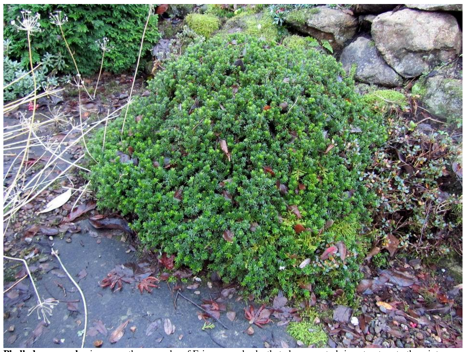
Phyllodoce caerulea is among the many dwarf Ericaceous shrubs that also serve to bring structure to the winter garden.