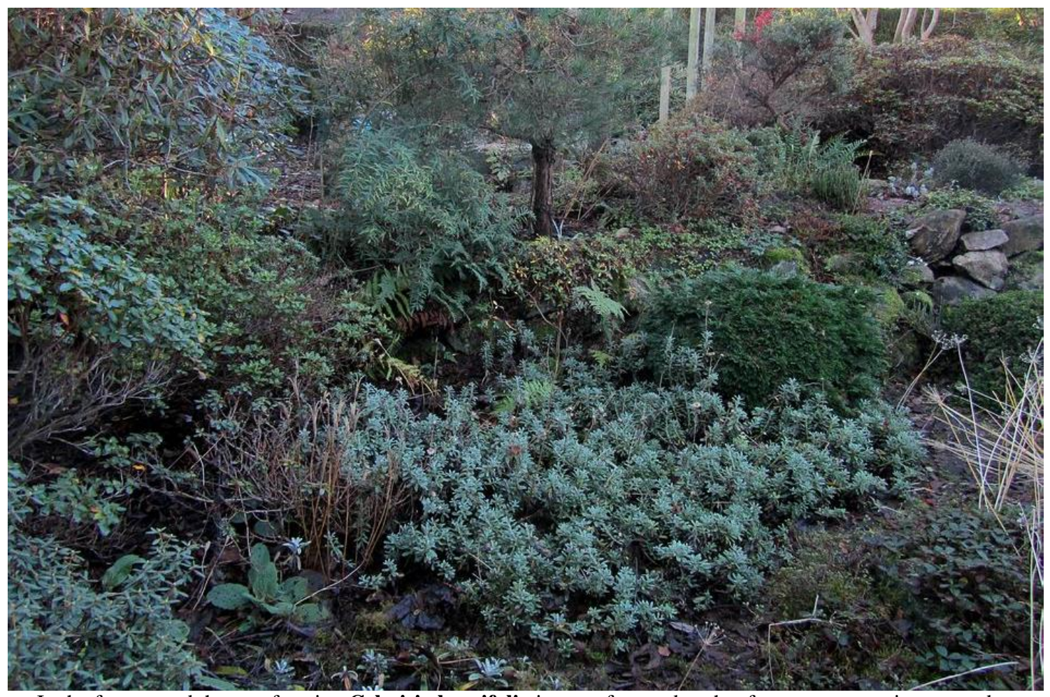
In the foreground the mat forming Celmisia brevifolia is one of a number that form great mats in our garden.

I got some worried messages when I cut this Cassiope wardi x fastigiata down to ground level a few years ago. I know from experience that it was the best way to regenerate the plant and keep it looking good. If left to their own devices the lower stems become brown and unattractive so cutting back encourages new growth to come from low down on the stems and