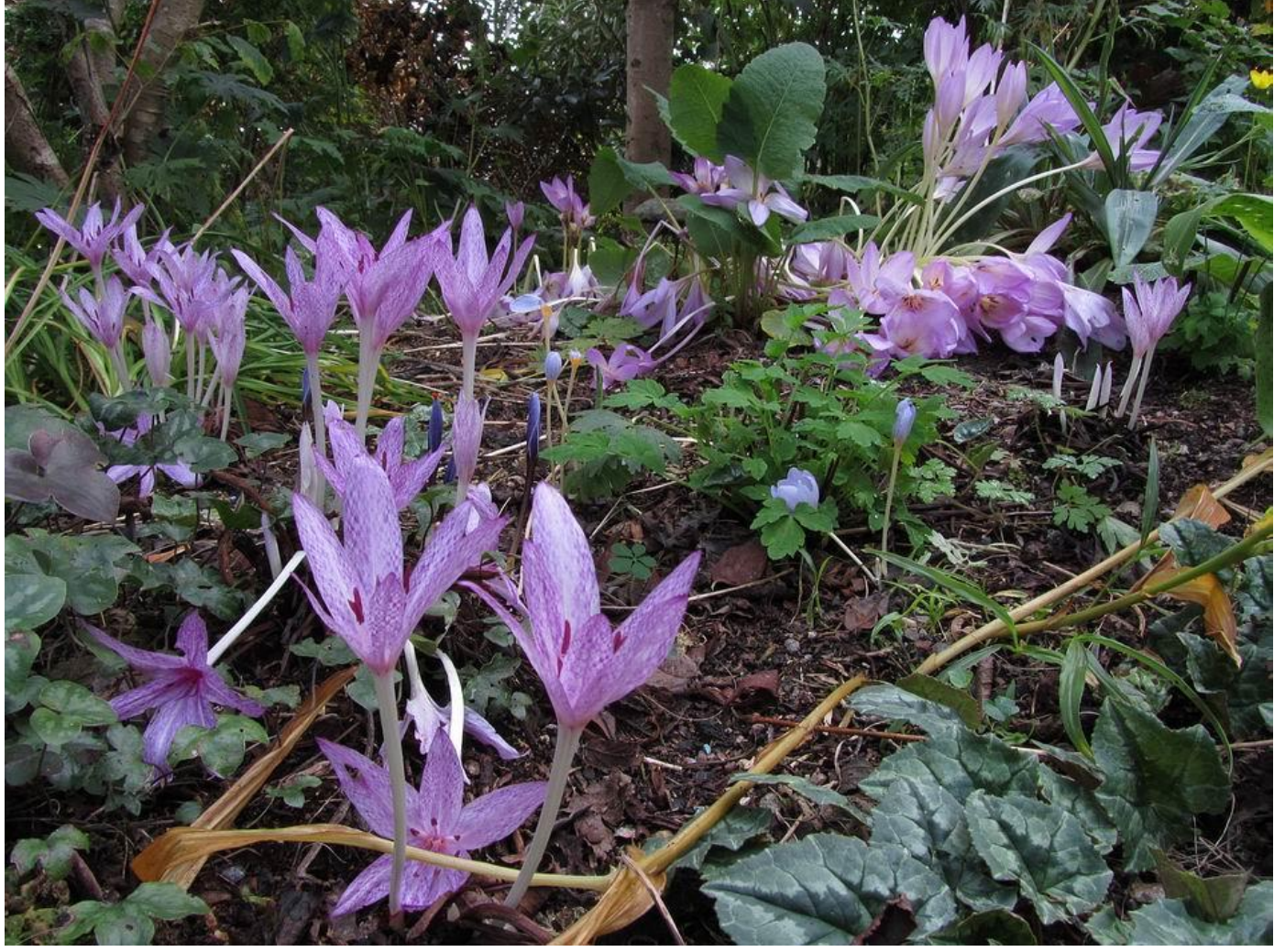
Colchicum and Crocus