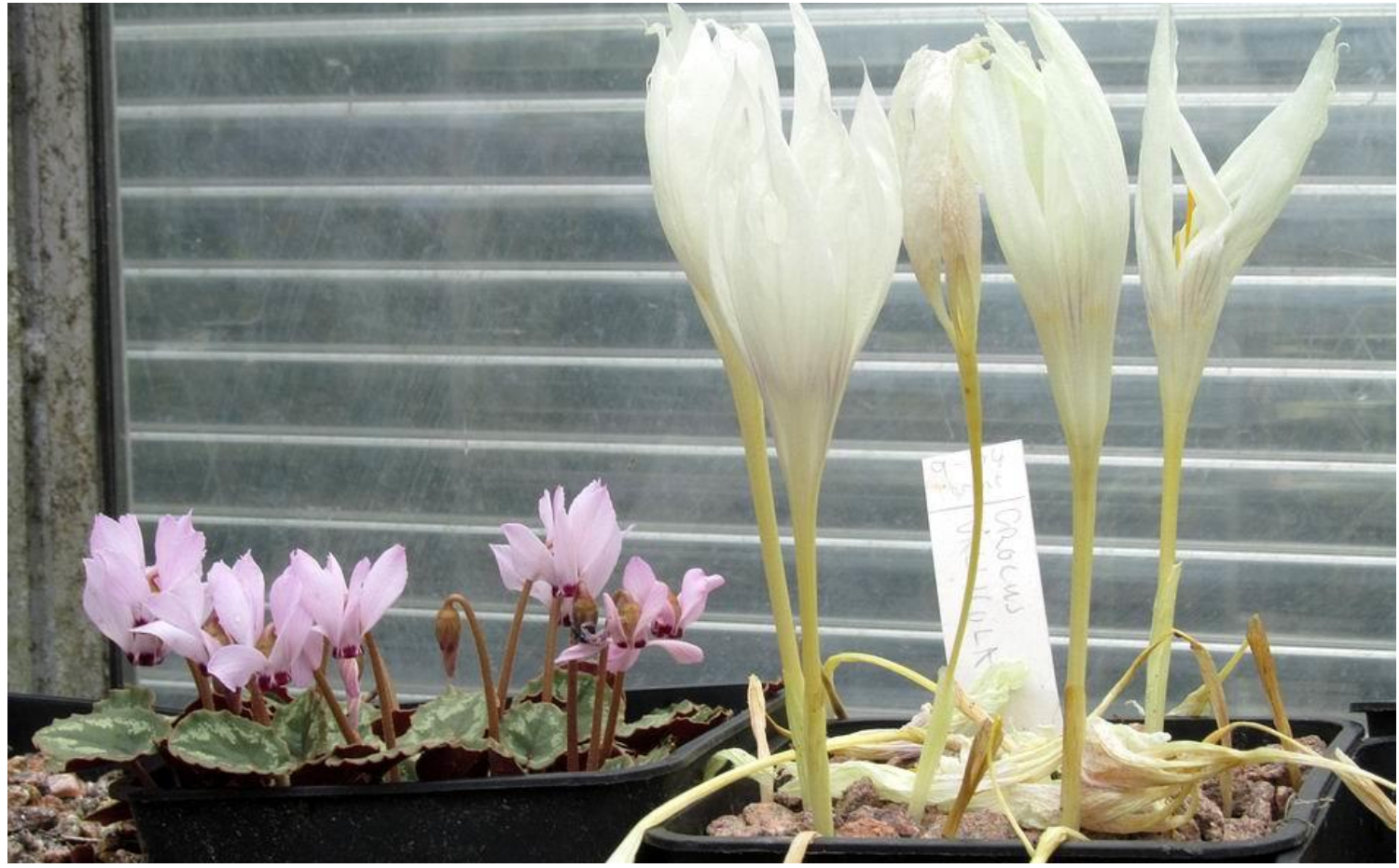
Cyclamen mirabile and Crocus vallicola showing the difference in size.