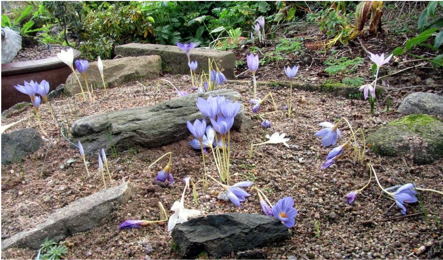
Colchicum baytopiorum seen growing top right in this sand bed along with crocus species and hybrids. The recent strong wind and rain has knocked many of the flowers over.