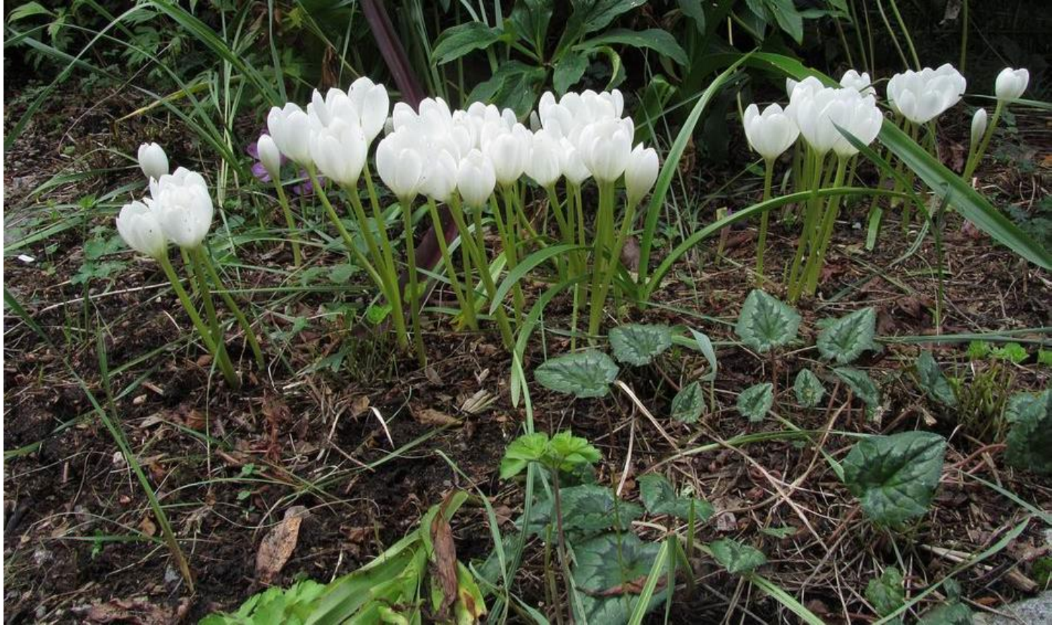
Colchicum speciosum album