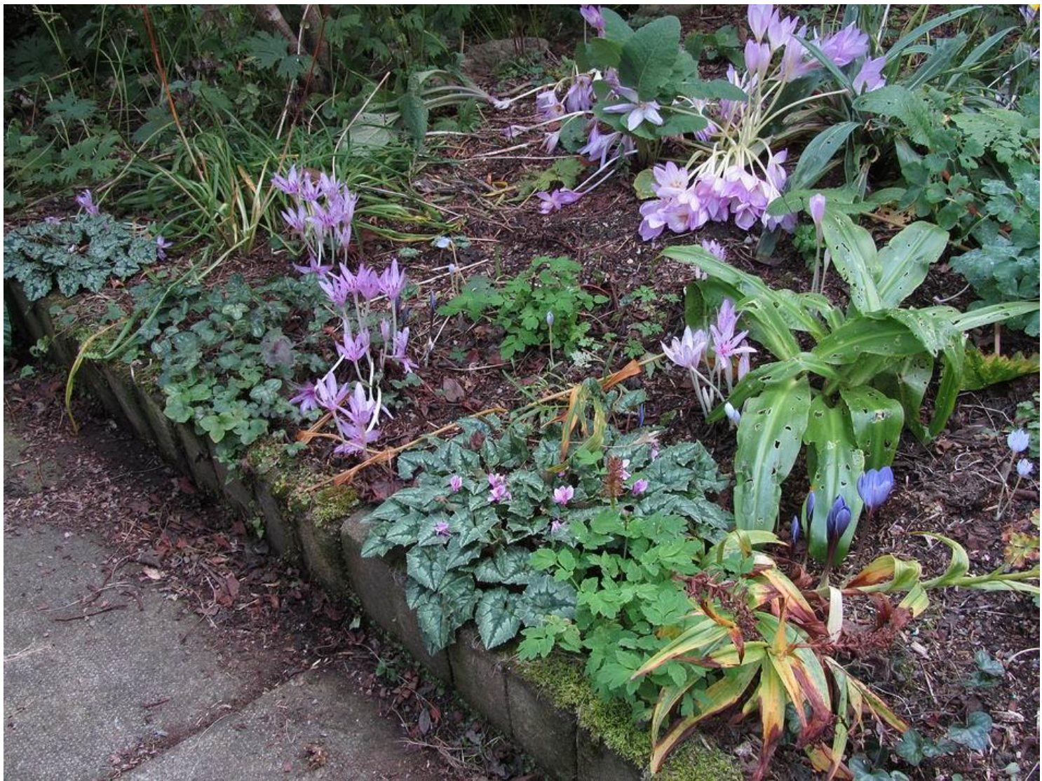
Even after strong winds and rain flattened some of the flowers to the ground they remain open and attractive.