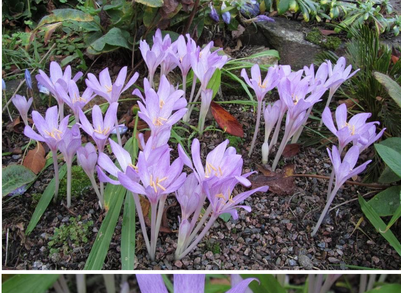
I have prepared logs for the next four weeks and obviously they will not be on what is in flower in the garden during October but I hope you will find them interesting.

This is the last Bulb Log I am writing before I depart for a trip to North America, I am touring around mostly the East, visiting both the USA and Canada. I have listed the Chapters I am visiting and the dates I will be there at the end of the log: if you want more information check out the <u>NARGS web site</u> or contact them through that platform.