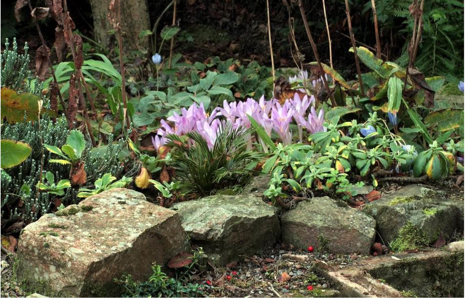
The shorter Colchicum aggripinum in the more sheltered rock bed stand up better.