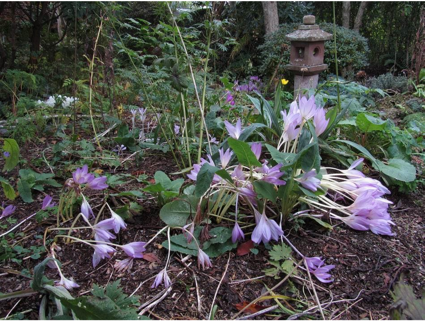
Some of the larger Colchicum after the wind and rain.