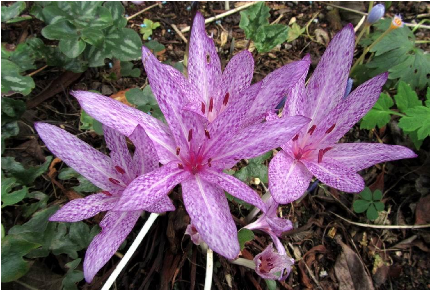
The second form of Colchicum agrippinum has more dramatic checkering and pointed petals. Both forms grow well and have smaller leaves than most of the other large species making them excellent plants for the rock garden.