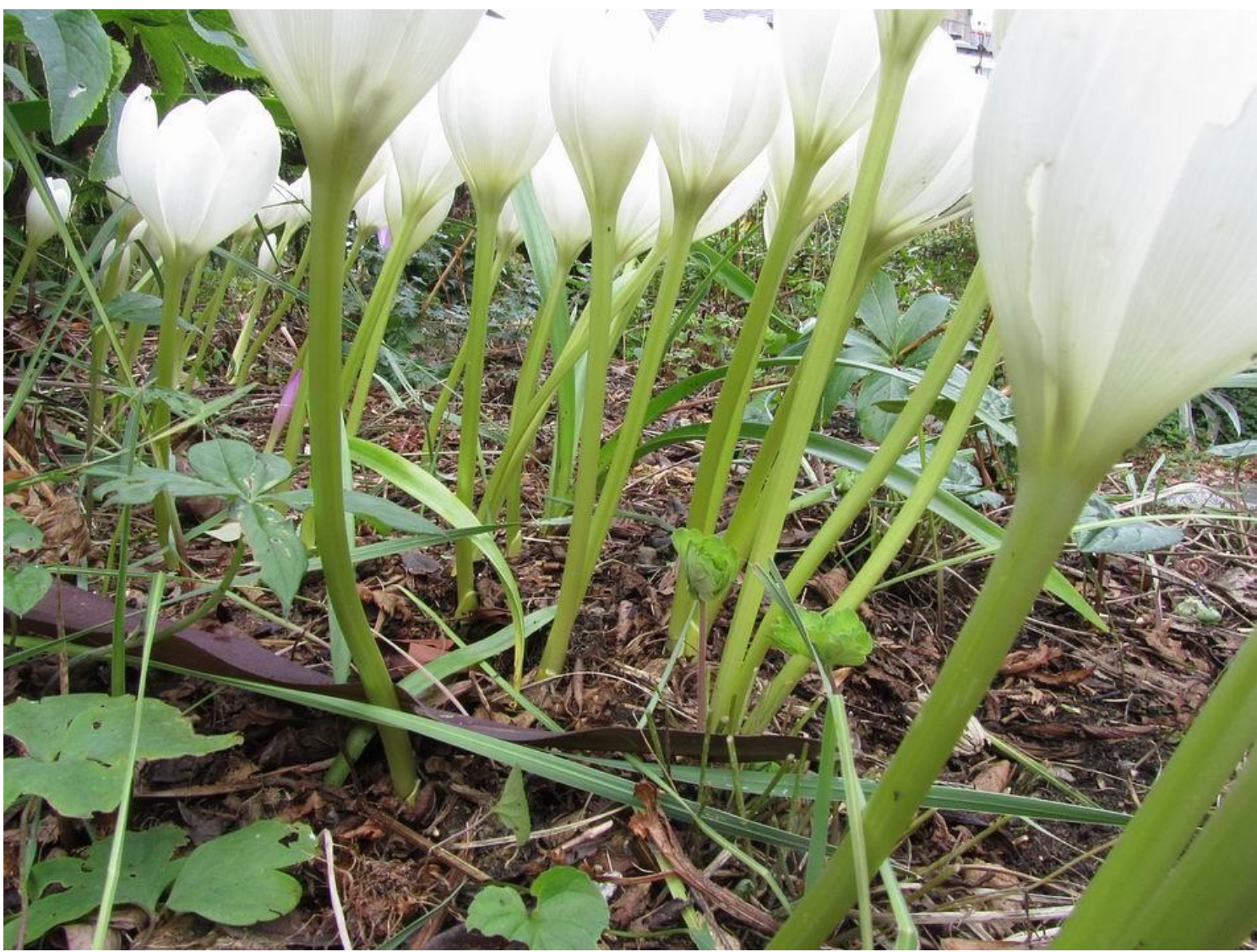
I love the contrast between the green tubes and the pure white goblet shaped flowers.