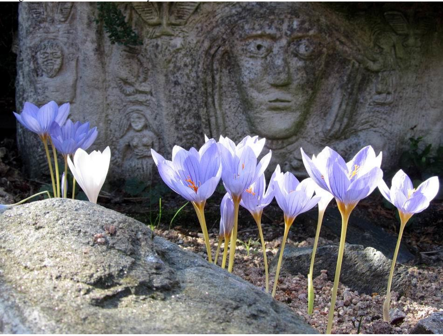
Mostly Crocus speciosus x pulchellus here enjoying the sunshine. Both Crocus and Colchicum produce multiple flowers from a single corm replacing those that have been flattened by the weather.