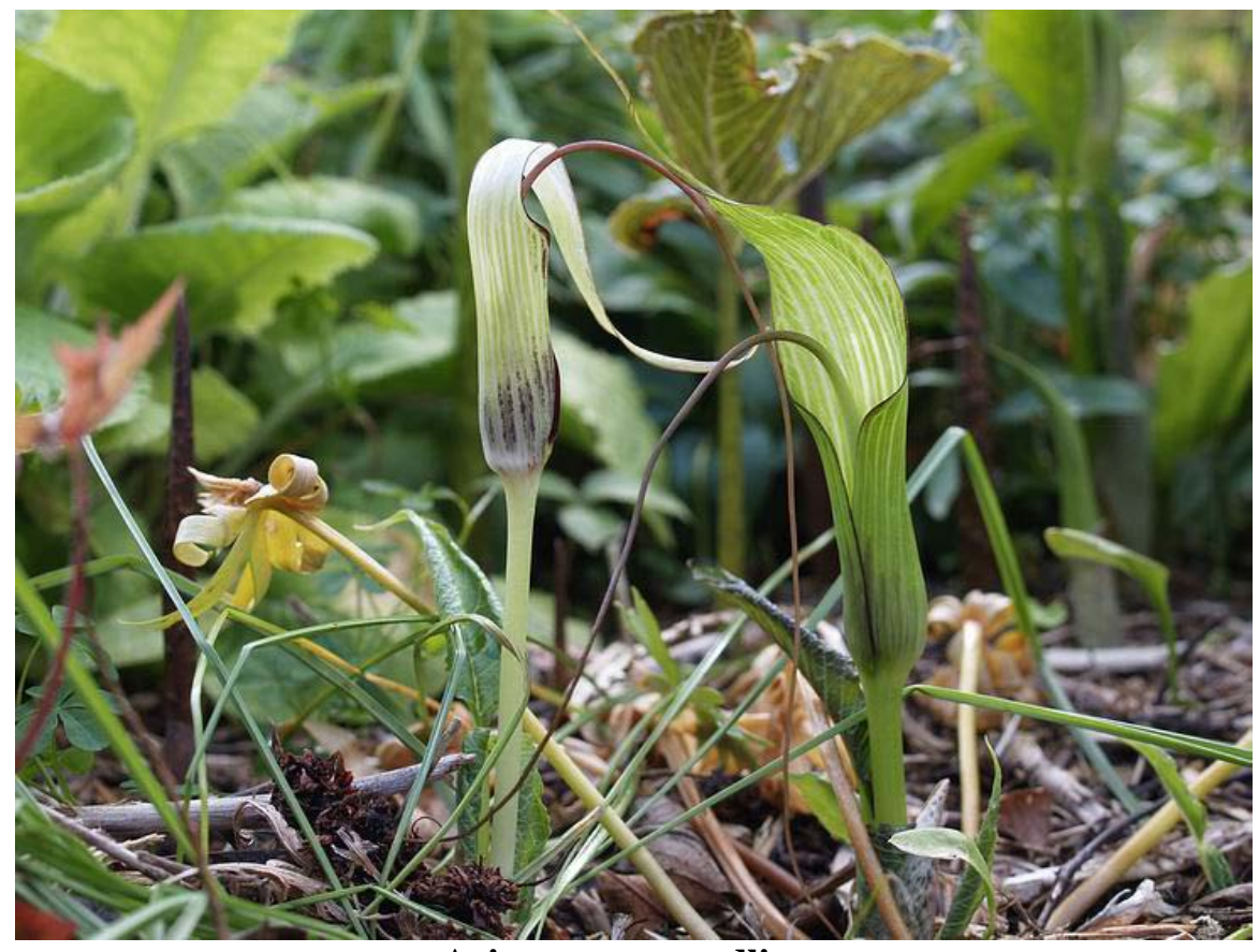
Arisaema sp. seedlings

One of the many Arisaema sp. that I have grown from seed and have yet to identify shows the variation in seedlings. The trouble is I have the book but I need to find the time when the plants are in flower to identify them - I tend to have the time to read the books in the winter months when the plants are dormant.