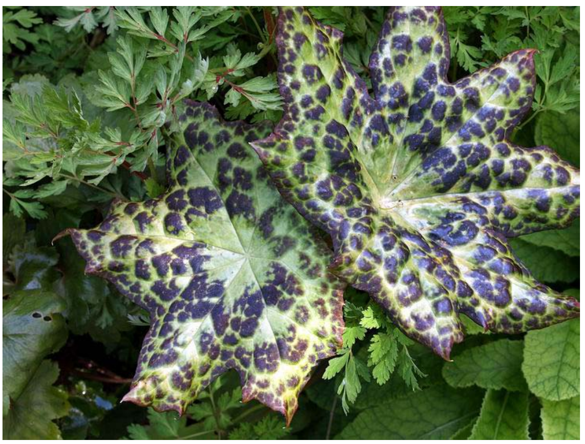
Podophyllum 'Spotty Dotty'

Podophyllum 'Spotty Dotty' is a cultivar with very dramatic leaves.