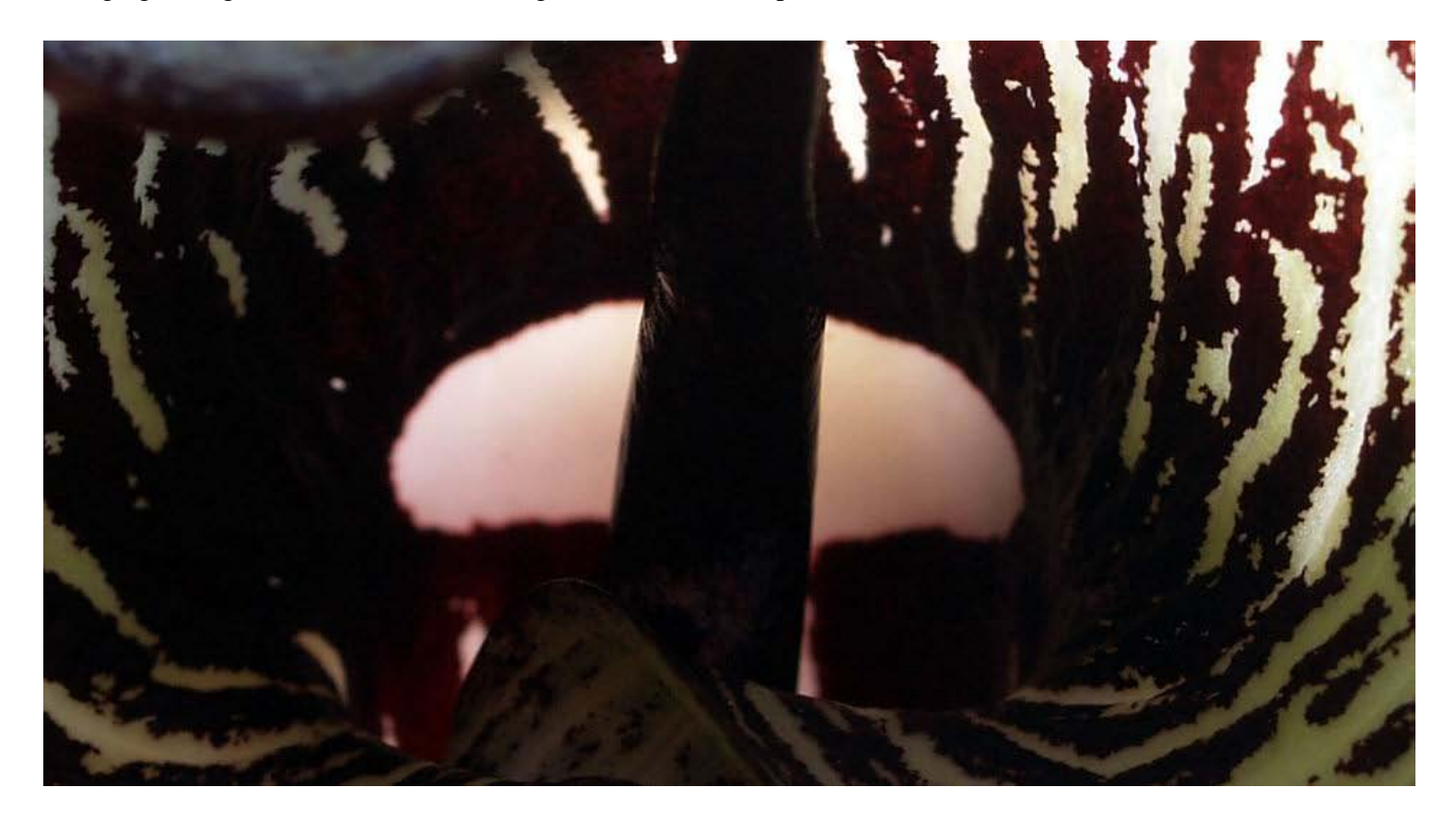
Who could not like these wonderful flowers with their bizarre if not abstract form and patterns?

I just got a tuber of Arisaema kiushianum in February. As we were in the midst of winter I planted it in a pot of leaf mould and kept it in a cold glasshouse where it was subjected to a lot of frosts and freezing. As it has survived the cold so far I decided to plant it out when I saw the first signs of the shoot emerging and now it seems to be happy enough growing in a humus rich bed alongside the unknown species above.