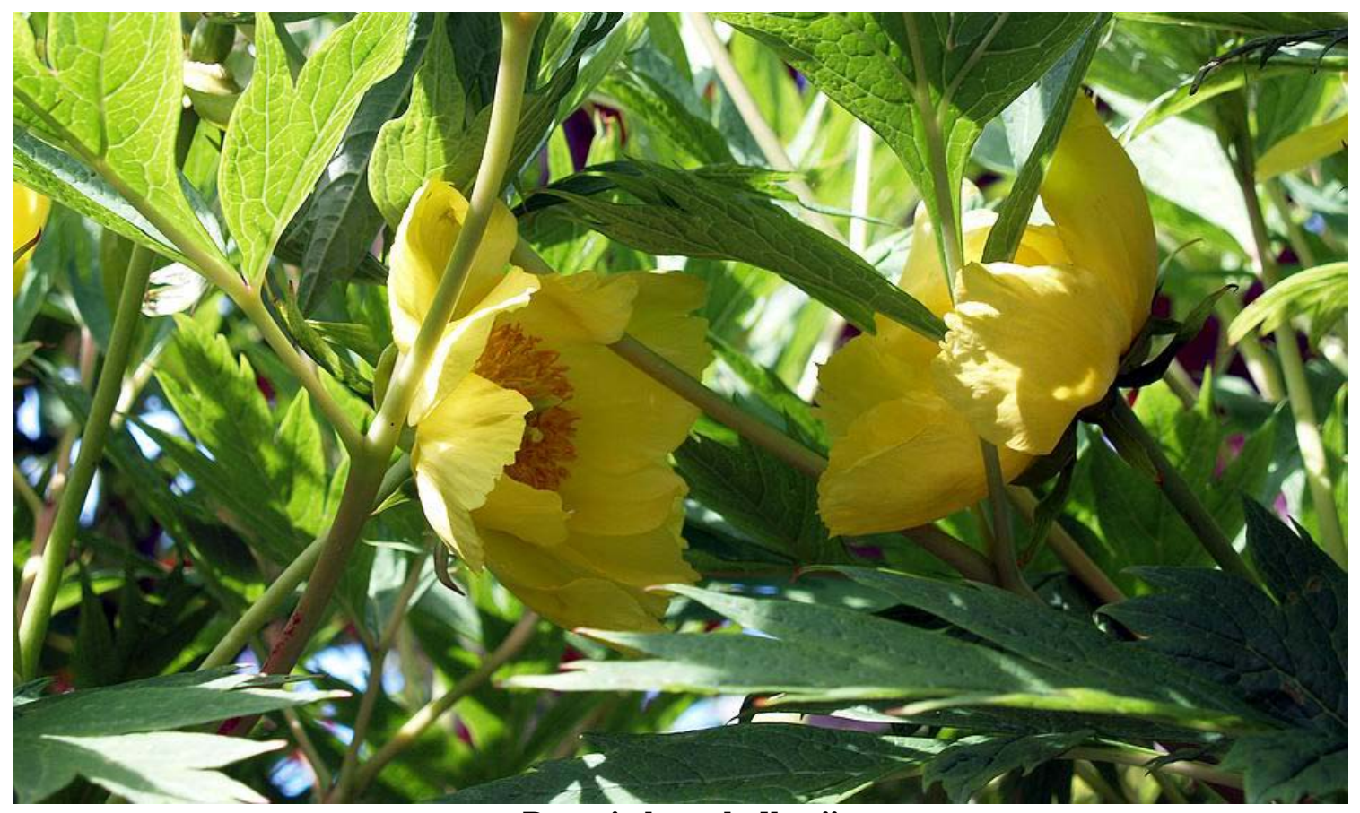
Paeonia lutea ludlowii

As much as I love bulbs I know that a planting of nothing but bulbs would just become a collection of bulbs and not a garden. We have created our garden to be like a small 'landscape' with all the elements that you would find in nature – trees to provide the canopy above our heads; larger shrubs to create barriers and give space and shape to the garden; low growing shrubs provide ground cover and year round structure while the bulbs and other herbaceous plants provide the seasonal highlights. Tree peonies are among the larger shrubs we have and you can see one on the right above.