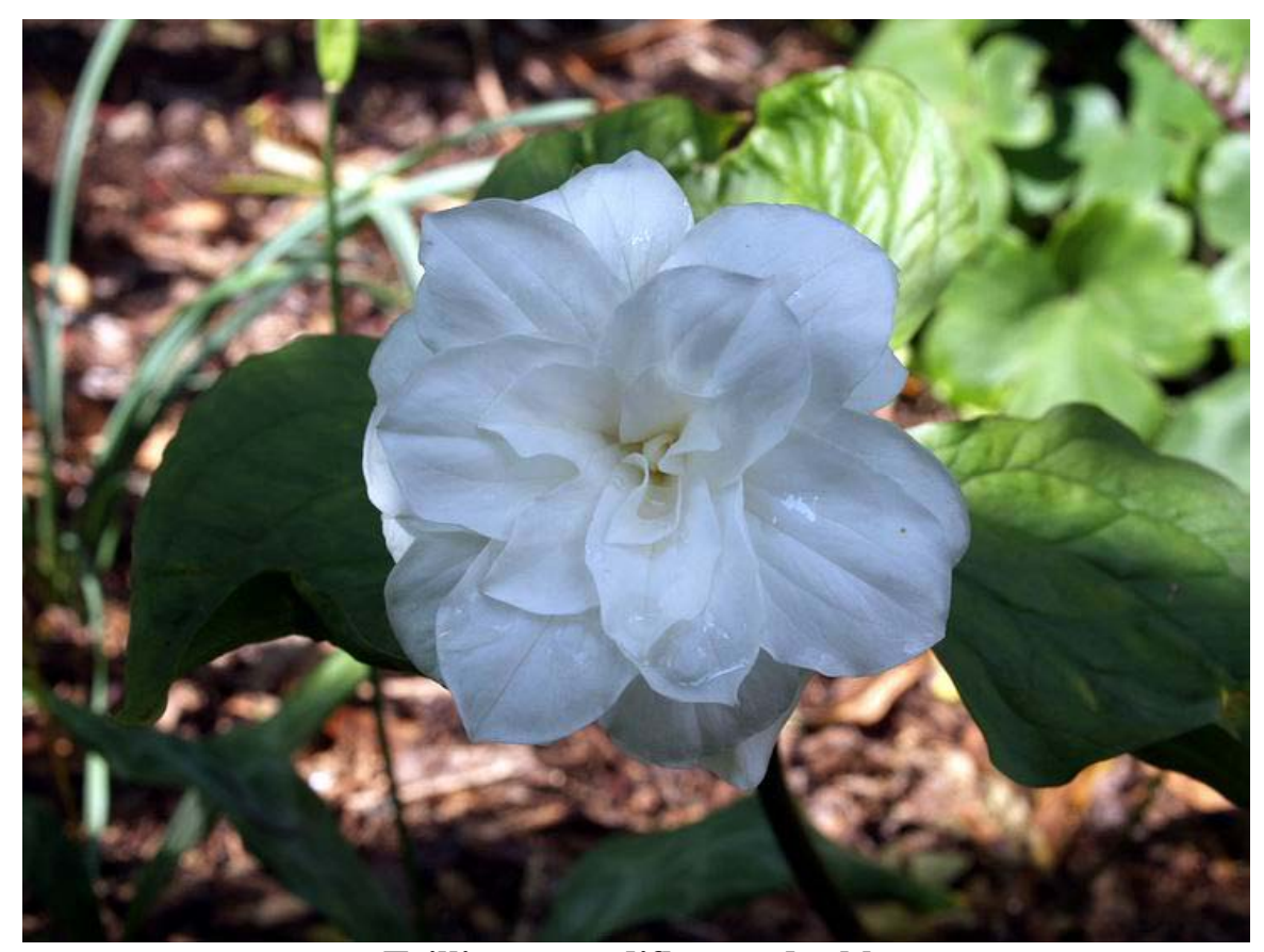
Trillium grandiflorum double

A number of trilliums are still hanging on to their flowers such as the double forms of Trillium grandiflorum. Many double flowers do not have the complete compliment of style and stamens and so are not fertile. The prime task of flowers is to attract pollinators to fertilise the plants and as these flowers cannot be fertilised they often keep going for longer than their fertilised siblings in the hope of fulfilling their task.